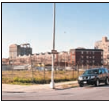
PFAREWELL: Pfizer, the maker of Viagra, has completed its pullout of Williamsburg by selling this Southside lot.