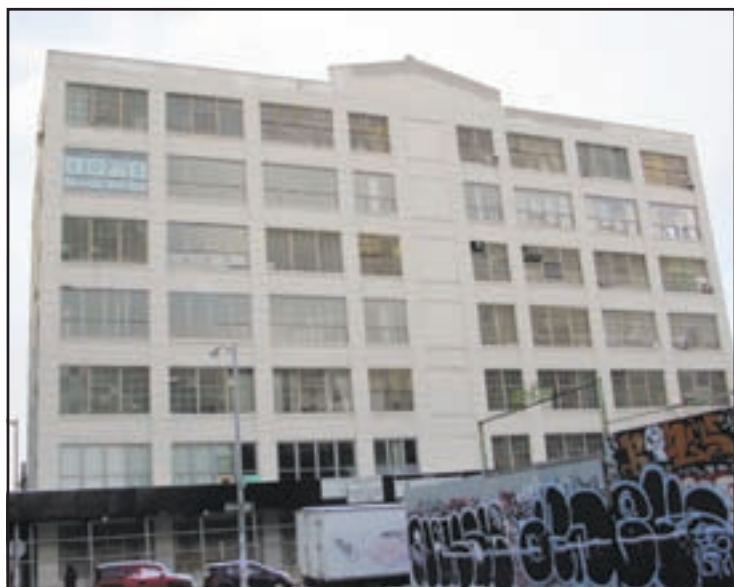
EVICITION NOTICE: Residents of this Berry Street building must move out by the end of the month.