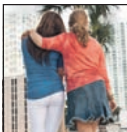
OUTLAWS: Hugging is against the rules at the Brooklyn Prospect Charter School.