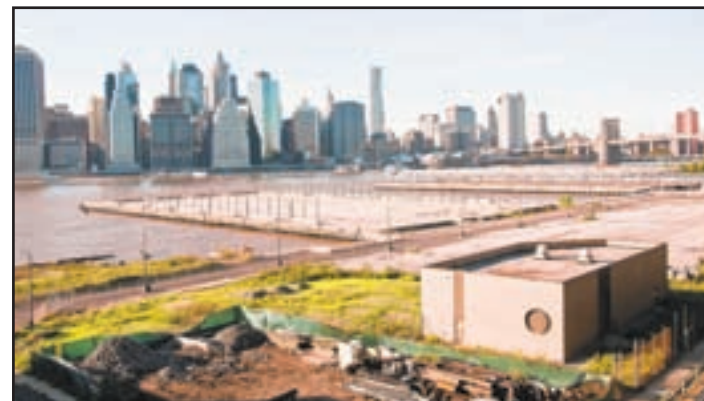
WHEELY GOOD NEWS: Brooklyn Bridge Park will get a Chelsea Piers-esque recreation center with a velodrome (that’s for racing bikes) near Pier 5 thanks to a huge donation from a single bicycle-loving park backer.