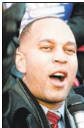
HEADING SOUTH: Assemblyman Hakeem Jeffries is vying to replace Rep. Ed Towns.

When borough congressional maps were redrawn last month as part of the decennial redistricting process, Towns received neigh-