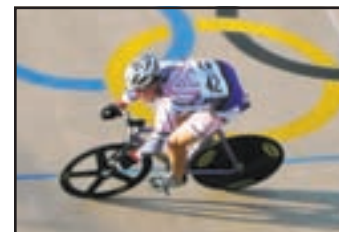
EXCITEBIKE: A bicyclist gave $40 million to Brooklyn Bridge Park to fund a sports complex with a velodrome.

Rechnittz’s field house by the foot of Joralemon Street will replace the proposed sports bubble, which would have been open from December to March, but did not include rest rooms