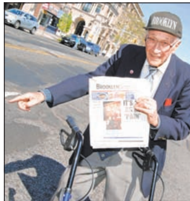
THE POWER OF POWSNER: All it took for the city to finally pave Avenue P was a column by BrooklynDaily.com's Lou Powsner.

headaches and butt-aches every times he rides along it, he claims.