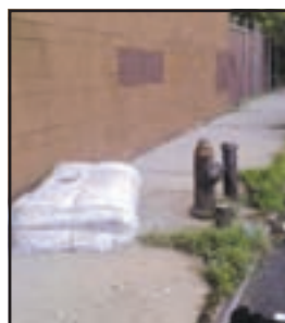
GET A ROOM: Neighbors say the alley behind Key Food is a meet-up spot for public sex.