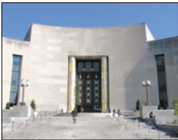
BIG WIN: The Brooklyn Public Library's main branch came out on top in a preservation competition, netting the beloved book depot $250,000 for repairs.