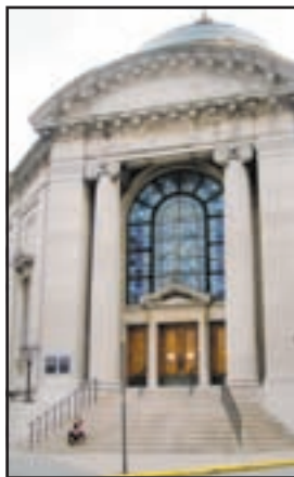
CASH FLOW: Congregation Beth Elohim in Park Slope received the second-most votes in the American Express-sponsored contest, and will also be awarded $250,000.

Both buildings received about eight percent