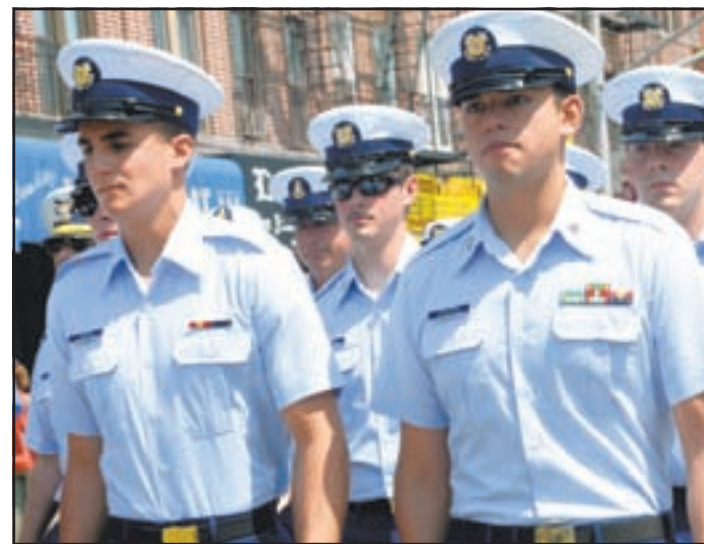
PORT PROTECTORS: Members of the Coast Guard march down Third Avenue in Bay Ridge on Memorial Day.