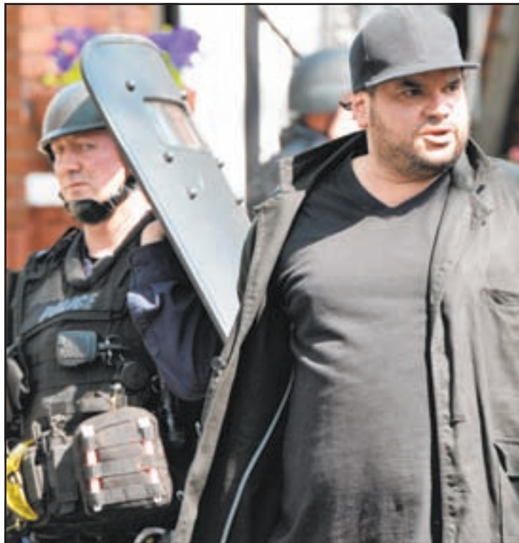
TAKEN INTO CUSTODY: Cops arrested this man, who they claim beat his girlfriend with the handle of a machete, following a two-hour standoff in Midwood.

But rumors swirled that the alleged assailant had a shotgun, forcing a standoff that dragged on for more than two hours before cops