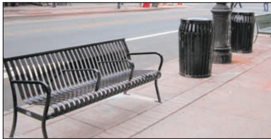
BENCH WARFARE: A Bay Ridge businessman says he will cover the cost of tearing out two street seats — but the neighborhood group responsible for sidewalks on Fifth Avenue won't let him.