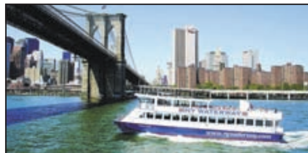
MAKING A SPLASH: The ferries that shuttle passengers between DUMBO, Williamsburg, Greenpoint, and Manhattan are so popular that operators got larger boats for busy summer weekends.