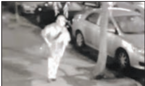
STILL WANTED: Residents say this man groped a woman near Fourth Avenue.

"The Williamsburg Spelling Bee" at Pete's Candy Store [709 Lorimer St. at Richardson Street in Williamsburg, (718) 302-3770, www.petescandystore.com ], June 4 at 7 pm. Free.