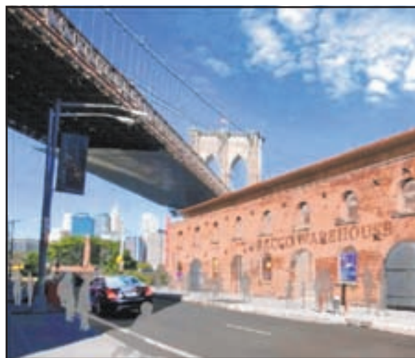
DRAMA IN DUMBO: St. Ann's Warehouse, known for its cutting-edge theater, will move to the Civil War-era Tobacco Warehouse under a city proposal that critics say gives public land over to a private company.

"Brooklyn Bridge Park has quickly become woven