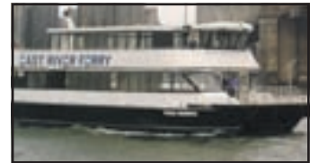
SMALL FRY: This thing is a minnow and we are dealing with whales.

Waterway officials are pushing the city and the Metropolitan Transportation Authority to allow passengers to pay for ferry