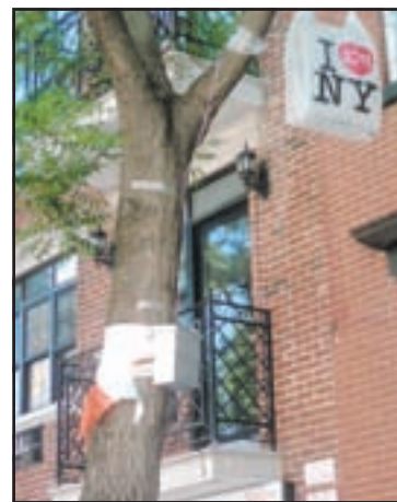
ART THREAT: Cops cordoned off Bedford Avenue last month when they saw a bag containing lights that an artist had affixed to a tree.