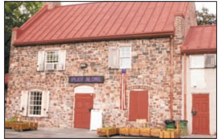
FLASH AND GO: A light-up sign has changed the look of the Old Stone House in Park Slope — but it won't be there for long.

"If it is temporary artwork, even if it's unsightly, preservation practice basically says it's okay," he said.