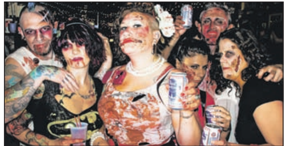
THIS PARTY'S DEAD: A group of The undead chillax with some choice brewskies.