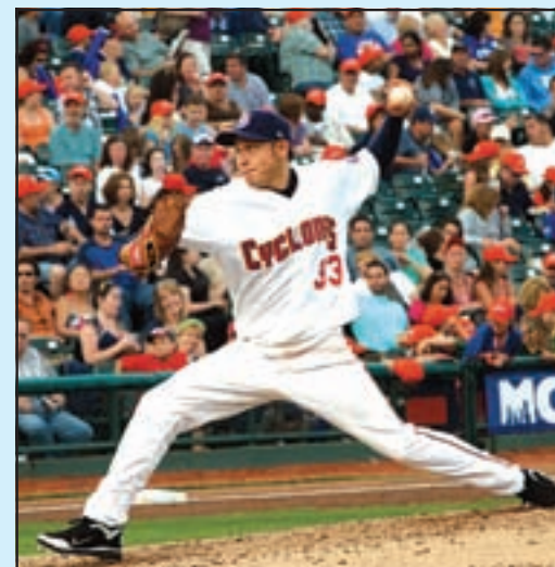
BATTER UP: Attending a Cyclones game is a beloved Brooklyn pastime.