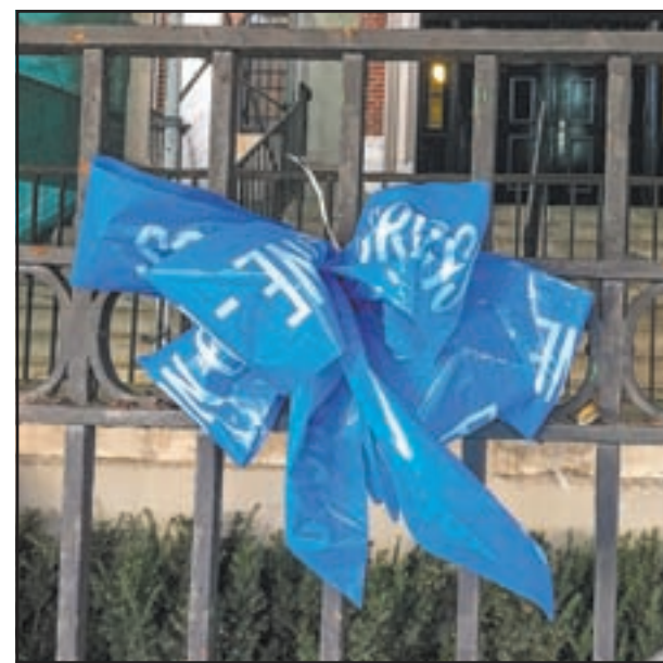
ALL TIED UP: Officials at IS 201 waited two hours to call 911 after a wall collapsed in a fourth-floor classroom.

But parents of kids in that classroom said the school never alerted them either. Of the dozen parents this paper spoke with, none said they got a call from the school after