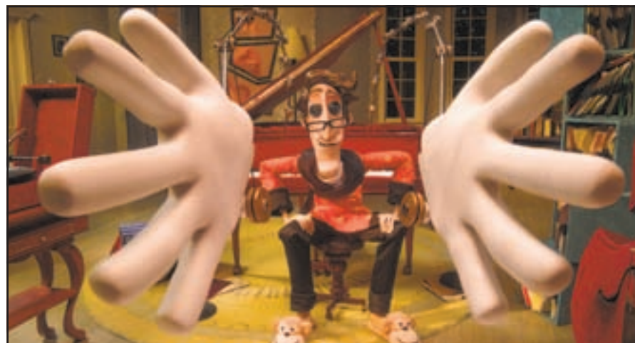
HANDS ON: These hands from the 2009 animated feature "Coraline" are going to slap you in the face.

"Poem-a-Rama: Poetry on the Wonder Wheel" at Deno's Wonder Wheel Amusement Park (3059 Denos Vourderis Place, entrance on W. 12th Street in Coney Island, www.parachuteliteraryarts.brownpapertickets.com). May 8 at 7 pm. $20 in advance, $25 at the door.