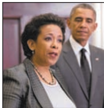
APPROVED!: Brooklyn's U.S. Attorney Loretta Lynch — President Obama's pick for the nation's top legal eagle — has finally been named attorney general.