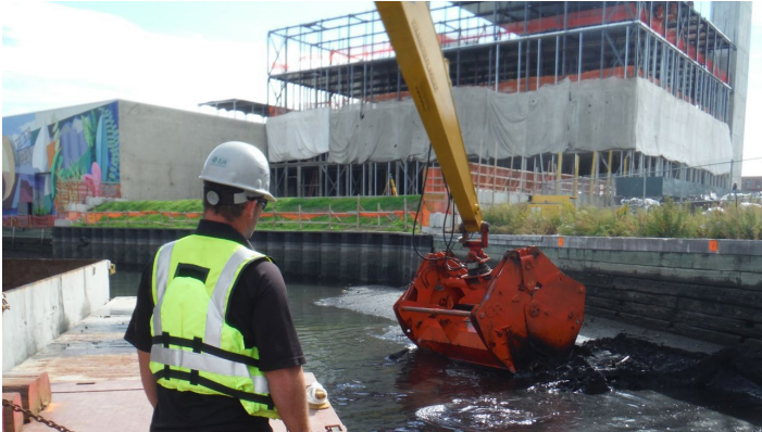
Excavator removing sediment from Gowanus Canal 4 th Street turning basin in 2018